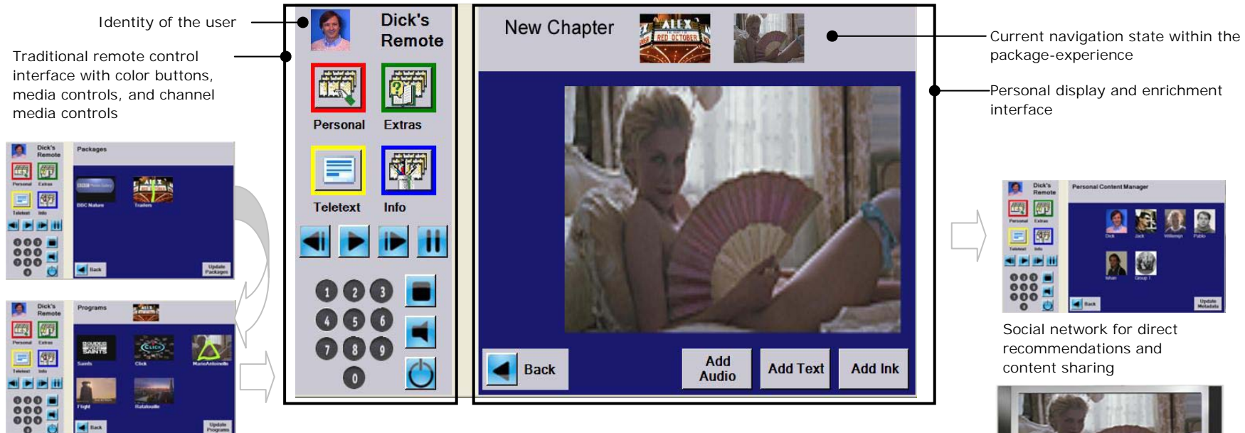
Figure 2 shows a sketch for providing the peer-sharing functionality. This is the first design for the final implementation of the system.

Micro-level navigation. The viewer uses gestures (in green) to navigate within packages and programs.